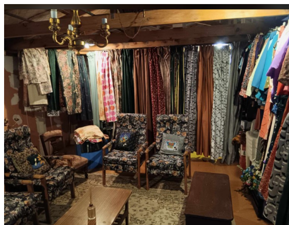
Curtains for the stage

Join our Messenger group for monthly information. The Info@littletheatre link is on the front page.