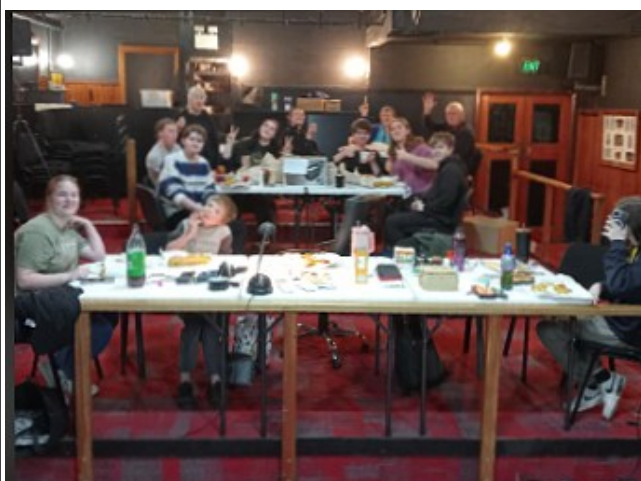
Double rehearsal with a cast and crew supper.